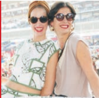
Fashion student flies DUT flag at Vodacom Durban July