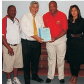
DUT Midlands Campuses impacting impoverished communities through sport