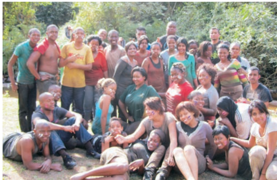
DUT Management Practice 3 students from the Environmental Health Programme at Boot Camp SA, Giba Gorge.