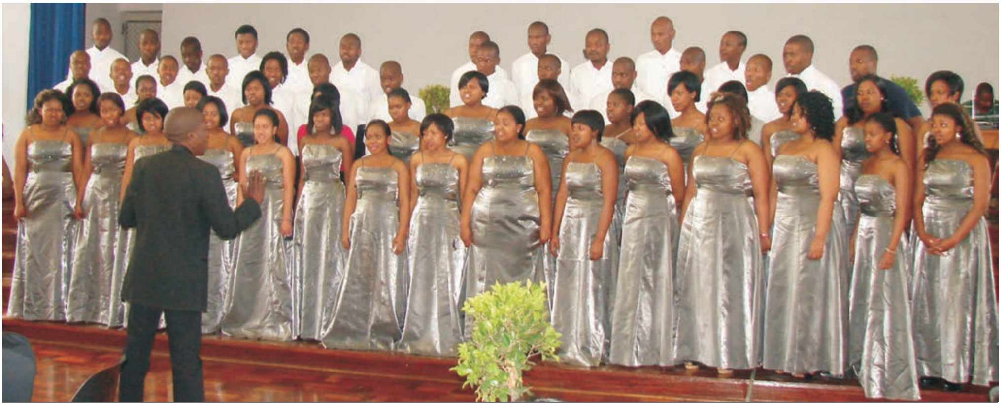
The DUT Midlands Campus Choir recently walked away with eight trophies at the South African Tertiary Institutions Choral Association (SATICA) 2012 Choral Competition in Cape Town. A total of 22 choirs participated in the competition which was held in July.