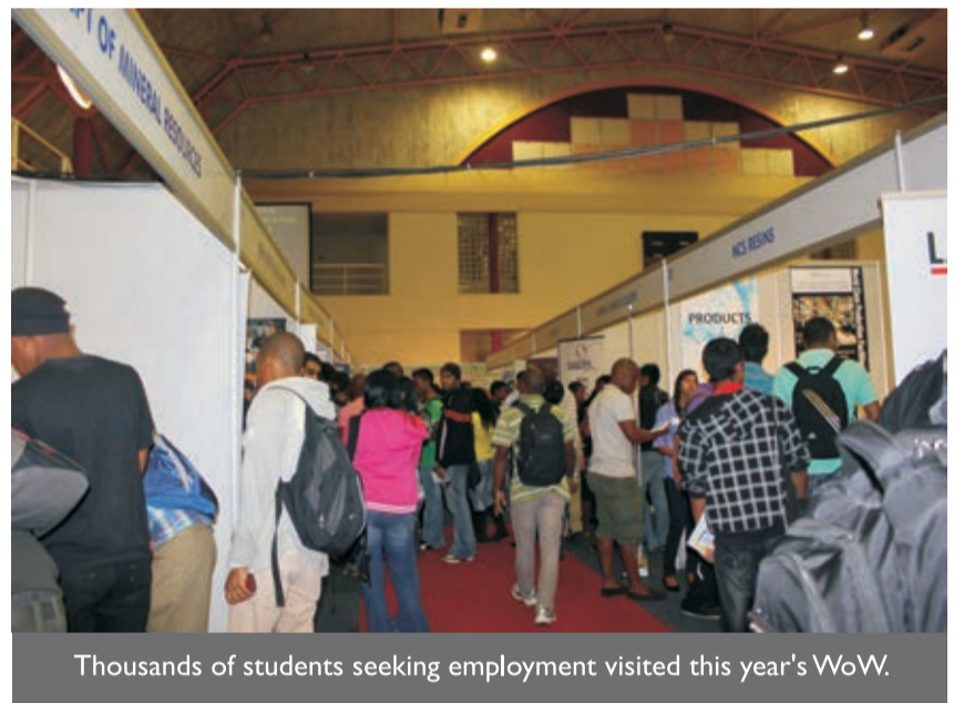
Thousands of students seeking employment visited this year's WoW.

Hosted by the DUT Department of Co-Operative Education, the event attracted the South African Air Force as well as companies from as far as Johannesburg and has been very fruitful over the years.