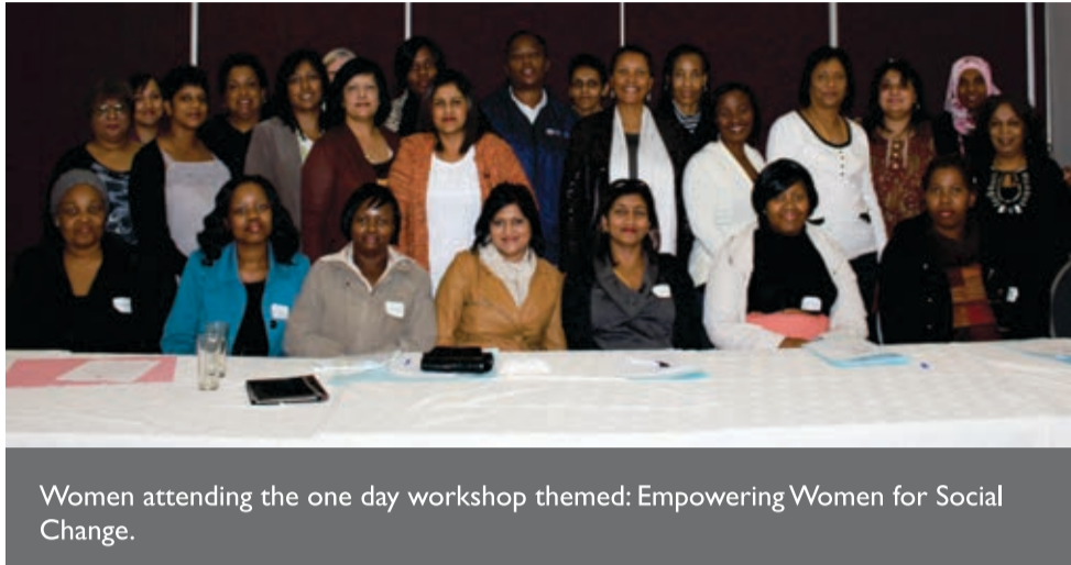
Women attending the one day workshop themed: Empowering Women for Social Change.