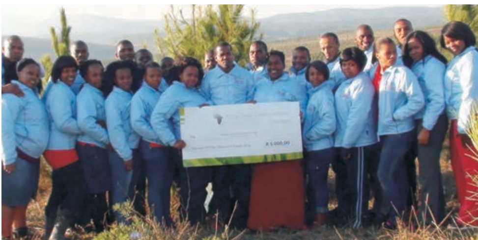
DUT Midlands House Committee and Residence Assistants team recently savoured the taste of sweet victory at the first African Green Campus Conference.