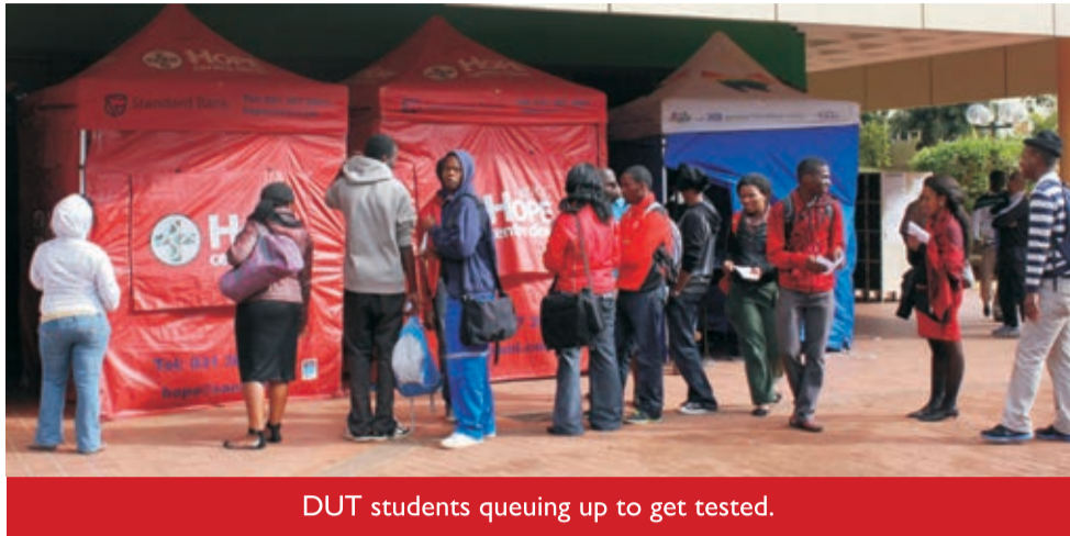
DUT students queuing up to get tested.

DUT's HIV/AIDS Centre visited all campuses at the University to raise awareness about HIV/AIDS and other related diseases in its second instalment of the First Thing's First campaign.