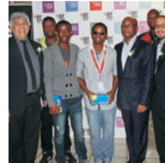
DUT signs MoU with Microsoft