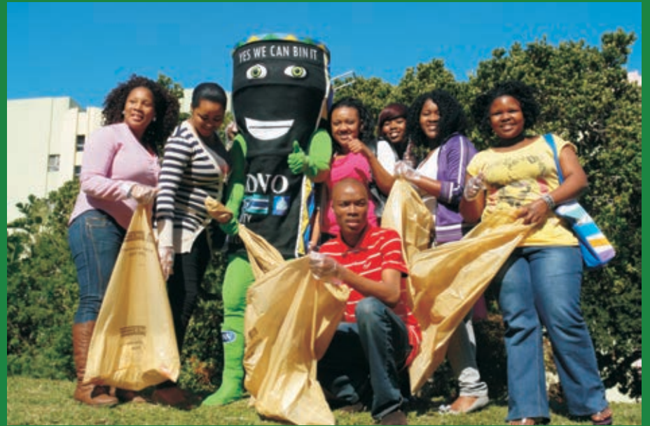
DUT Environmental Health Studies students clean up the University during the Go Green @ DUT clean-up campaign aimed at raising awareness about waste disposal at DUT.