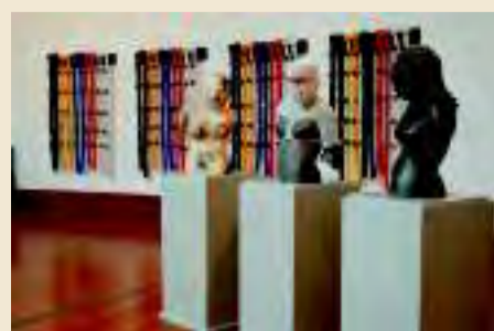
DUT Collaborates on Exhibition