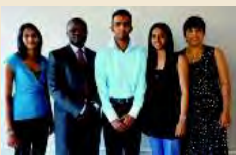
Become Chemical Engineers To Be Reckoned With