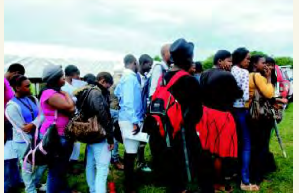
Staff and students at the 'First Things First' Campaign.

For over three decades, scores of people have been infected with and lost to HIV/AIDS.