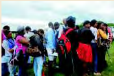
DUT Staff and Students Test For HIV