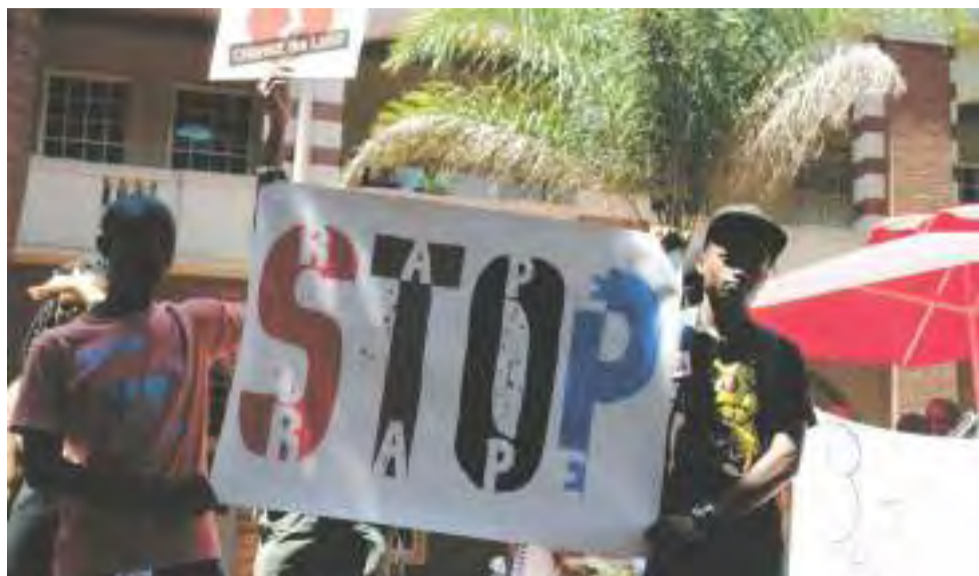
Pictured: DUT students and lecturers came together last month at the DUT City Campus and stood up against rape and gender based violence in a united front.

The rampant sexual abuse of women and children in South Africa and around the world, recently prompted the Academic Development Office within the Faculty of Arts and Design to stand up and raise awareness about this scourge.