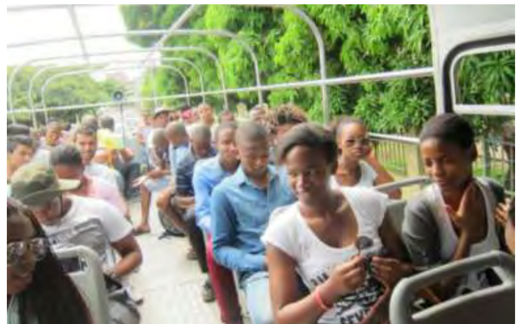
Pictured: Town and Regional Planning students at DUT get a tour of the city of Durban during their orientation.

She now plans to motivate her subordinates to take up post graduate studies in order to reach her level.