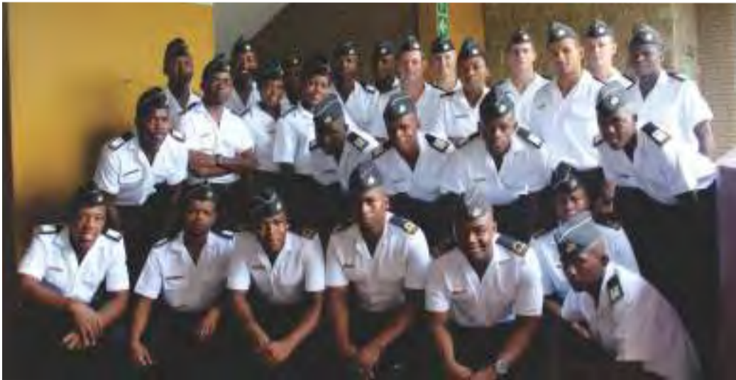
Looking dashing in their uniform, this is the first group of SA Navy students to enroll for the general navigation course now offered at DUT as part of an agreement between the SA Navy and the DUT Maritime Studies Department as from the beginning of this year (2013).

DUT is the new base for teaching South African Navy students basic navigation skills.