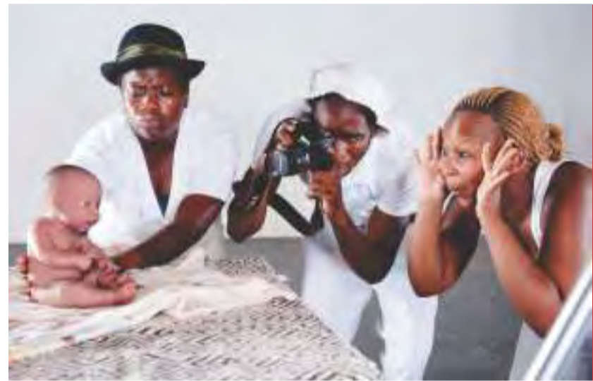
Pictured: Absurd comedy at its best. Drama studies students replay a scene by Bavarian writer Karl Valentin where a photographer takes pictures of a baby while his camera lens is closed.

This was the first selection of Valentin's scenes to be presented on the African continent.