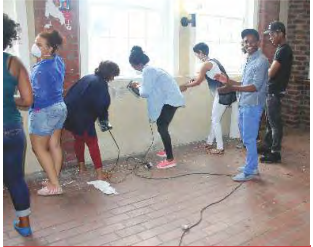
Pictured: Second and third-year students in the Interior Design Programme who had been tasked with revamping public spaces of the DUT City Campus work on the campus student cafeteria. The My Campus project officially started in January 2013.

The My Campus project, an initiative aimed at designing and revamping public spaces of the DUT City Campus, officially kicked off at the beginning of this year and promises a fresher, more revived look to the campus's targeted spaces.